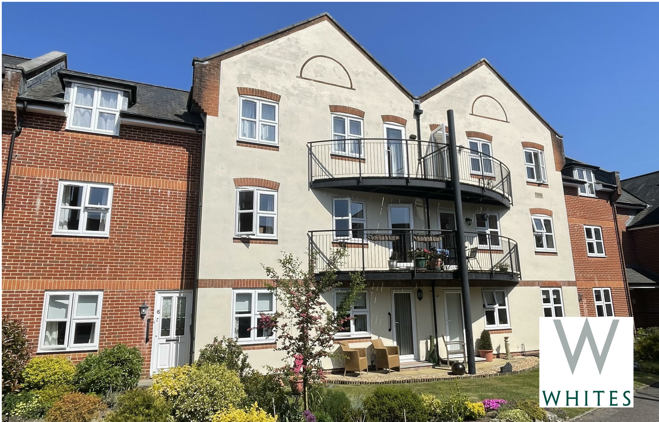
Flat 14, 49-61 St. Edmunds Church Street, Salisbury, Wiltshire, SP1 £325,000 Leasehold - Share of Freehold 1FD